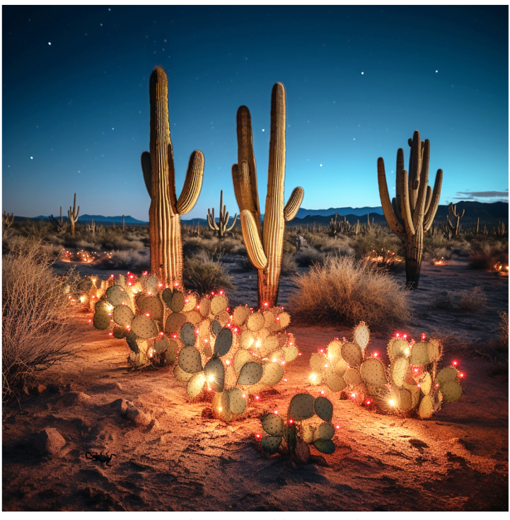
Puzzle created by Joe Thompson © 2023